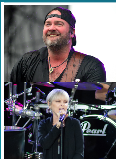
2019 Lee Brice & Pat Benatar