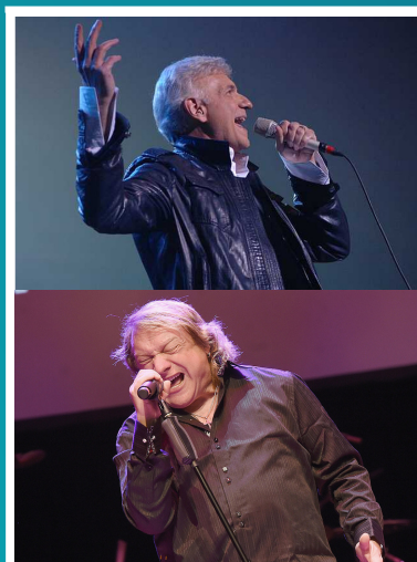
2018 Dennis DeYoung & Lou Gramm