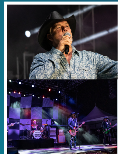
2021 Trace Adkins & Cheap Trick