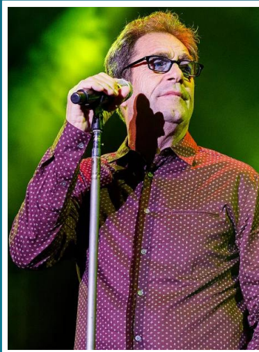
2016 Huey Lewis & The News