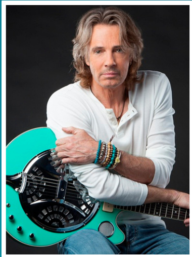
2015 Rick Springfield