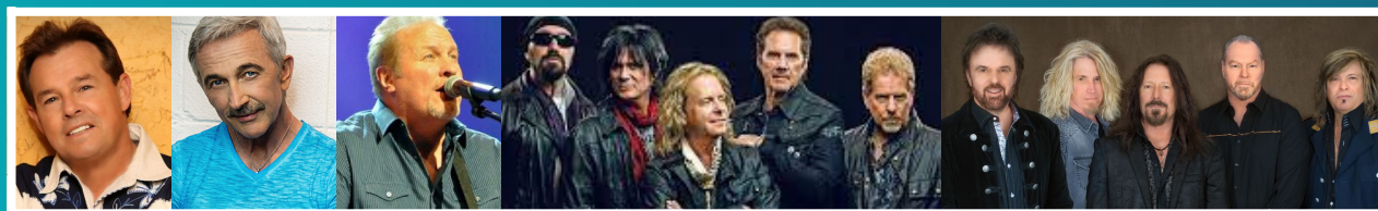
2022 Sammy Kershaw, Aaron Tippin, Collin Raye, 38 Special, and Night Ranger